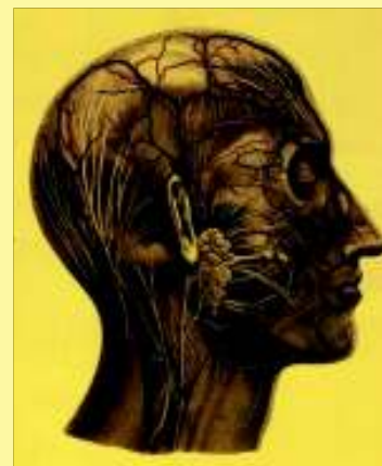
ANATOMY OF THE FACE Cadaver dissection workshop

Transportation included: Return bus trip Hilton Vienna → Graz → Hilton Vienna is provided Departure Hilton Vienna 6am Departure Graz 5pm